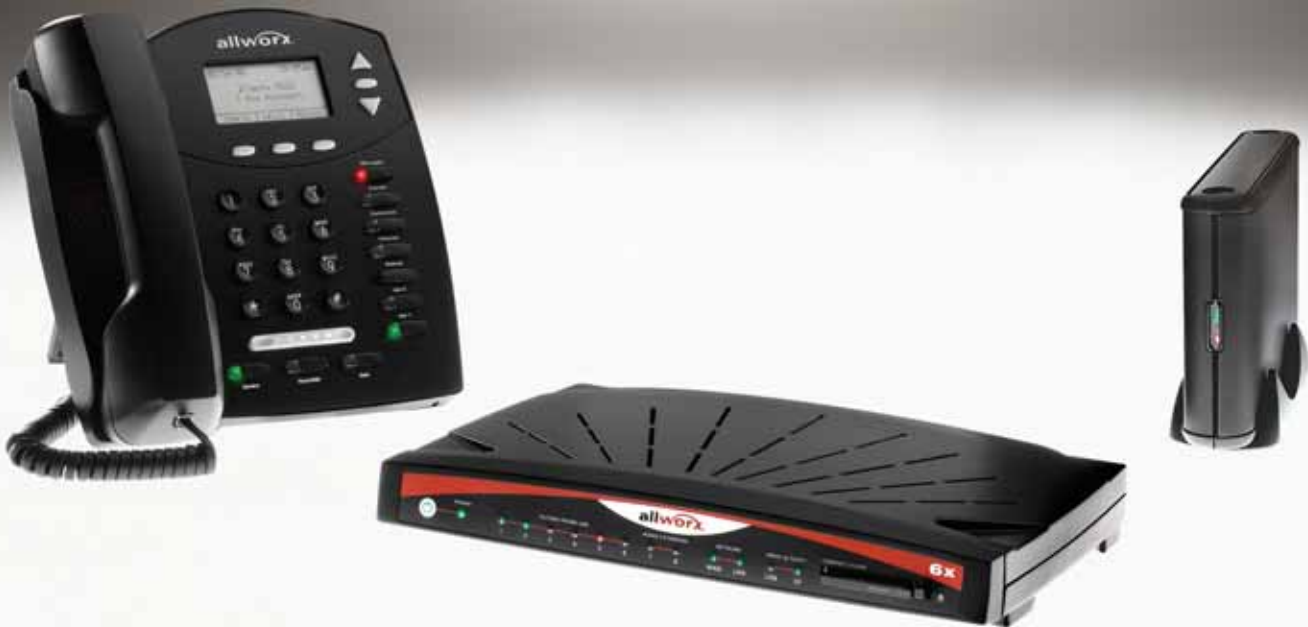
The Allworx 6x System, shown with Allworx 9102 phone and optional USB hard disk.